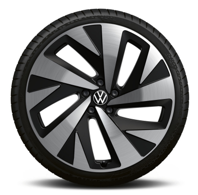
Optional on ID.4 PURE / PURE PLUS / PRO / PRO PLUS

20" 'Drammen' alloy wheels 8J x 20 in front, 9J x 20 in rear Tyres: 235/50 R20 in front 255/45 R20 in rear