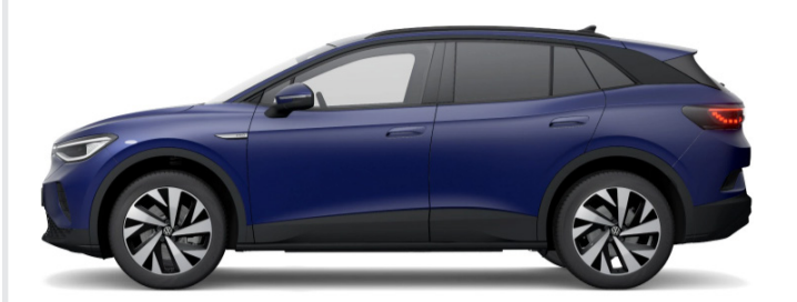
Blue Dusk Metallic<sup>1</sup>