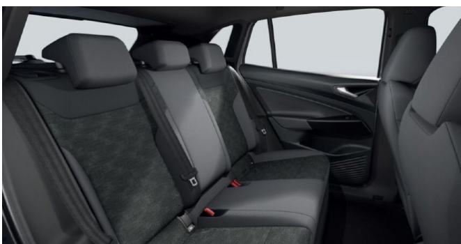
The above specifications are for information purposes only as our products are continually updated and changes may be made to the specifications at any time. If you require any specific feature, you must consult your local dealer who is regularly updated with any change in specification. Specifications are subject to change without notice.