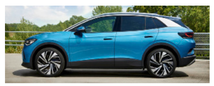
Costa Azul Metallic1,2