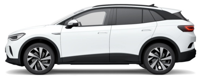
Glacier White Metallic<sup>1</sup>