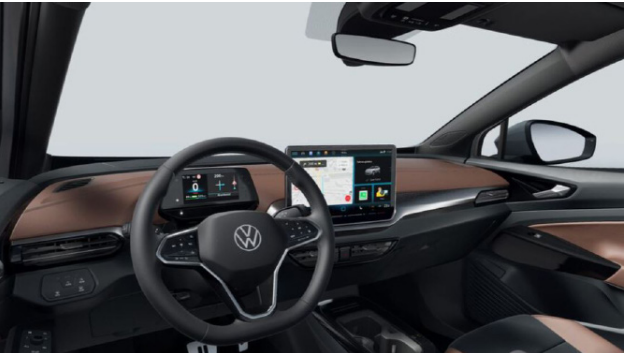
Standard selection from ID.4 PURE PLUS / PRO PLUS