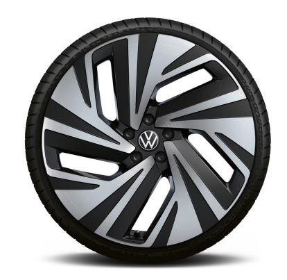
Optional on ID.4 PRO / PRO PLUS & ID.4 GTX

20" 'Ystad' alloy wheels 8J x 20 in front, 9J x 20 in rear Tyres: 235/50 R20 in front 255/45 R20 in rear