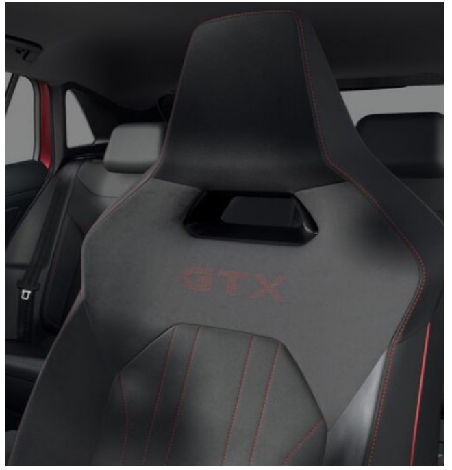
GTX Art Velours/Leatherette Soul/Flash Red Standard on ID.4 GTX PLUS Optional on ID.4 GTX

Note: Some parts of leather interior trim will contain artificial leather. Note: The print processes do not allow exact reproduction of the upholstery & insert colours.