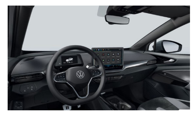
Standard from ID.4 PURE / PRO