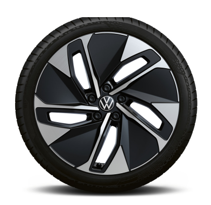
STANDARD ON ID.4 PRO PLUS Optional on ID.4 PURE / PURE PLUS / PRO

21" 'Narvik' in Black alloy wheels 8.5J x 21 in front, 9J x 21 in rear Tyres: 235/45 R21 in front 255/40 R21 in rear