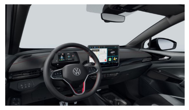
Standard on ID.4 GTX / GTX PLUS