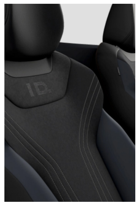
Artvelours Microfleece/Leatherette Soul/Platinum Grey Standard from ID.4 PURE PLUS / PRO PLUS Optional on ID.4 PURE / PRO Electric controls are available via the addition of the Interior Plus Package