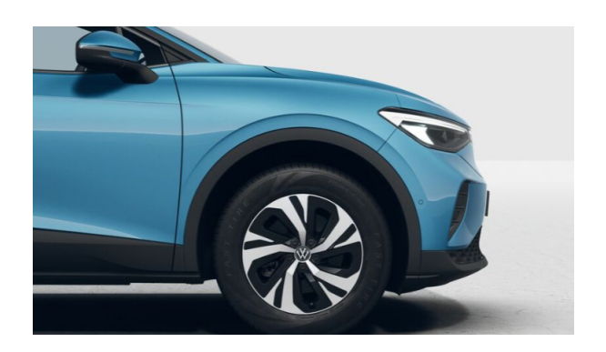
STANDARD ON ID.4 PURE PLUS Optional on ID.4 PURE 18" 'Falun' alloy wheels