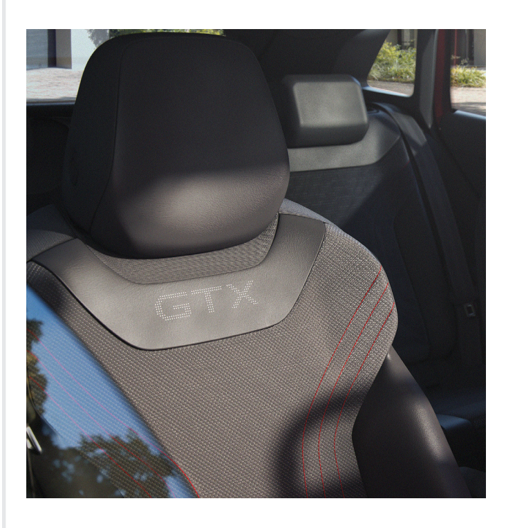
GTX Cloth/Leatherette Soul/Flash Red Standard on ID.4 GTX