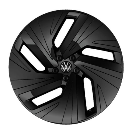
Optional on ID.4 GTX

20" 'Drammen' alloy wheels 8J x 20 in front, 9J x 20 in rear Tyres: 235/50 R20 in front 255/45 R20 in rear