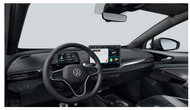
Standard from ID.4 PURE PLUS / PRO PLUS