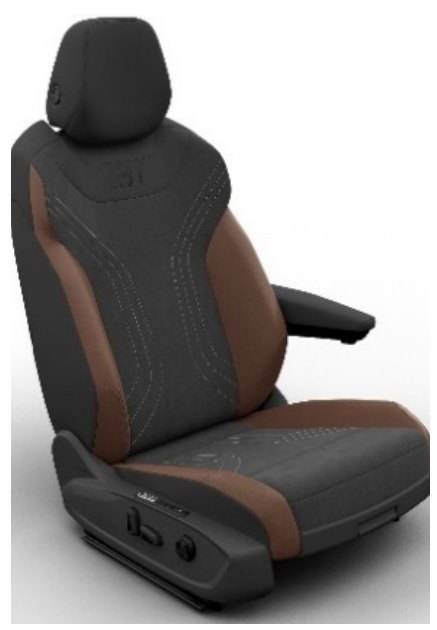
Artvelours Microfleece/Leatherette Soul/Florence Brown Standard from ID.4 PURE PLUS / PRO PLUS Optional on ID.4 PURE / PRO Electric controls are available via the addition of the Interior Plus Package