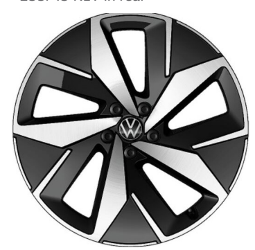
STANDARD ON ID.4 GTX

19" 'Hamar' alloy wheels 8J x 19 in front, 9J x 19 in rear Tyres: 235/50 R19 in front 255/45 R19 in rear