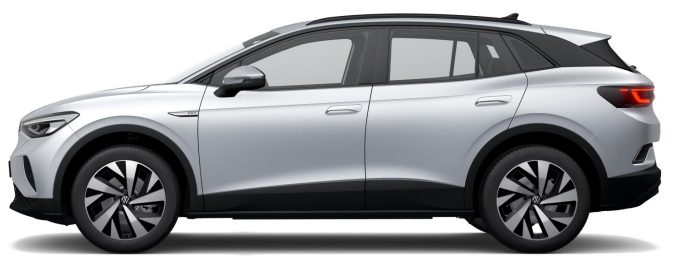
Scale Silver Metallic<sup>1</sup>