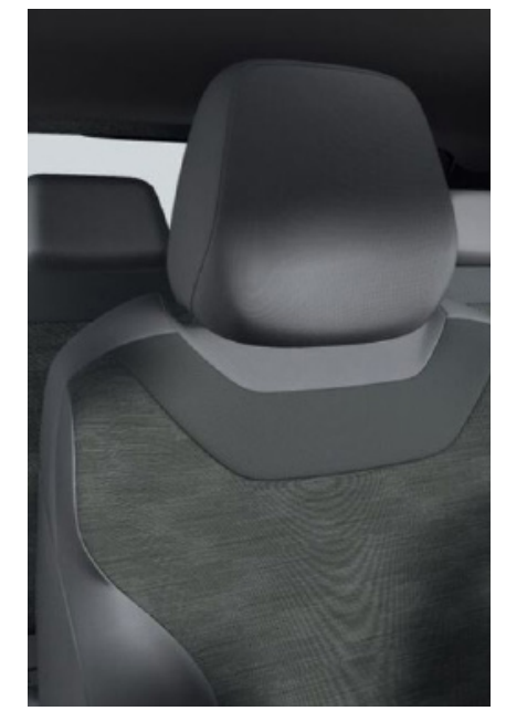
Fabric 'Matrix' Soul/Platinum Grey Standard from ID.4 PURE / PRO