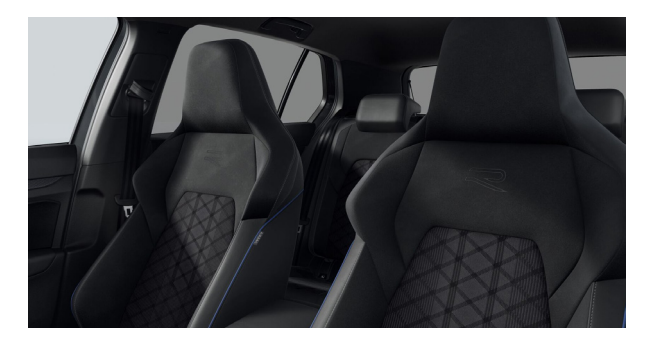
'R-Line' cloth Anthracite (IR) Standard on R-Line models

* Optional at extra cost. Please note, the print processes do not allow exact reproduction of the upholstery colours.