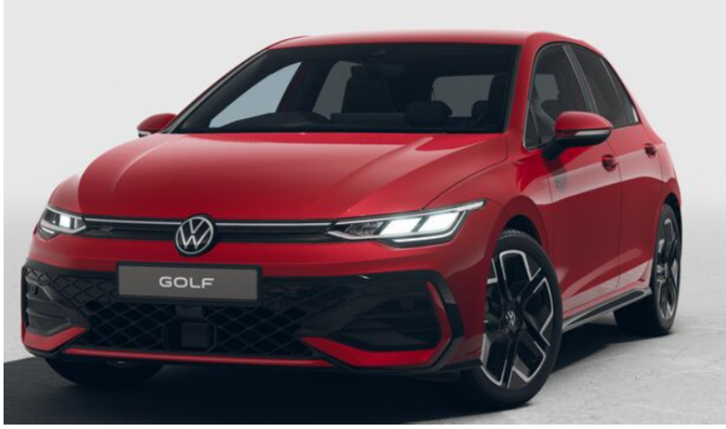
Note: The above image displays colour Kings Red Metallic