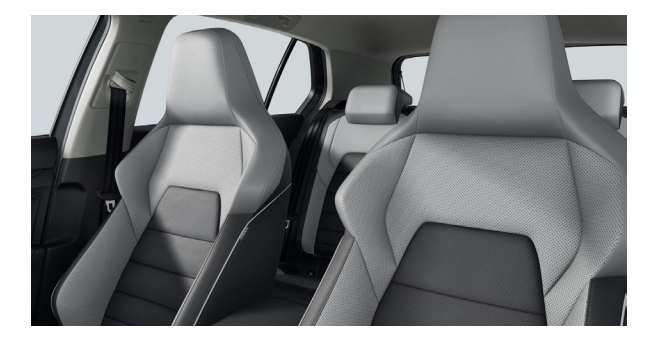
'Vienna' Leather WL3 Pack Soul (BD) Option on Style models Note: Not availabe on DA14BM